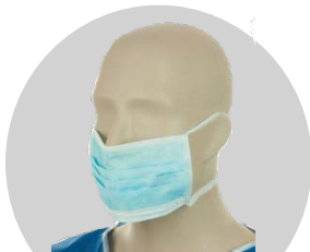
3 ply Surgical Face Mask