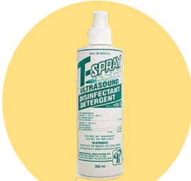
Disinfectant for Coronavirus

Ideal for shoes, door knobs, phones & medical devices.