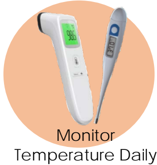
Monitor Temperature Daily

It is better to be safe than sorry. Use Personal Protective Equipment. (PPE)