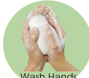
Wash Hands with Soap