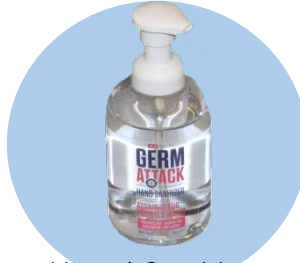
Hand Sanitiser with 70% Alcohol

Ideal for shoes, door knobs, phones & medical devices.